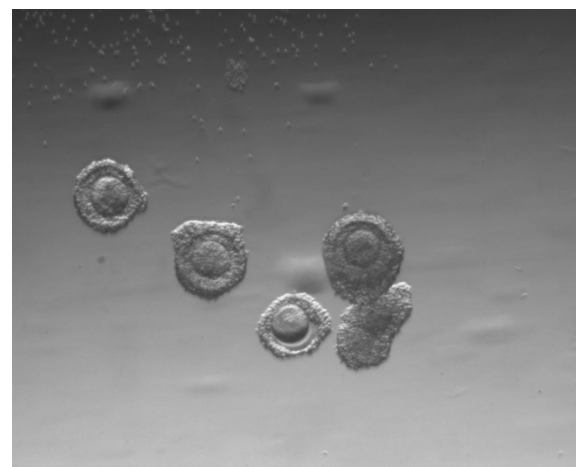
Figure 1 Immature oocytes with compacted or sparse cumulus in the non hCG-primed group.