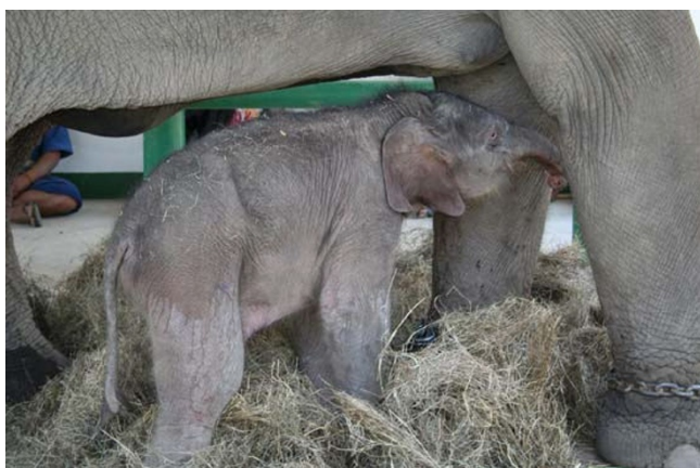
Figure 3 AI baby born from chilled semen with his mother.

anatomy was not remarkably changed during pregnancy period except that her belly was enlarged during the last sixth month period. Furthermore, one month before calving, her breasts were enlarged and had a clear secretion released when they were stimulated. Khod gave a birth on March 7, 2007 with birth weight of 51 kg. The gestation length was 663 days and the sex of elephant baby was male (Figure 3). The calf was apparently normal in health and behaviour and had a normal suckling reflex.