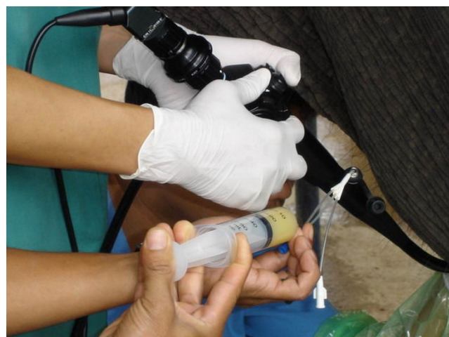
Figure 1 Semen was deposited via insemination catheter through endoscope working channel.

For AI, the endoscopic technique was modified by increasing inflated air from external electric air pump without using the balloon catheter. The inflated air could enlarge the vestibular, vaginal and cervical canal. After the tip of endoscope reached and fixed at the cervical canal, the air tube was removed and replaced by insemination catheter (IC). The IC was passed through the working channel of the endoscope and penetrated deep into the body of uterus. The semen was deposited into body of uterus without signs of semen reflux (Figure 1). A fiber optic video endoscope, video processing circuit and light source of PENTAX (EPM3300 and EC3830 fz) were used. Transrectal ultrasonography (ALOKA; SSD 500 with convex transducer probe; 3.5 MHz and linear transducer; 5.0 MHz and Sonosite model 180 Plus hand-carried ultrasound with convex transducer probe C60 2.0–5.0 MHz) was used to guide the endoscope and to locate the site of semen deposit.