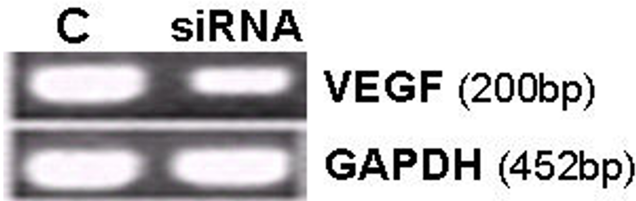
Figure 1 VEGF siRNA-generating pDNA down regulates VEGF mRNA levels in rat heart fibroblasts. The VEGF gene silencing efficiency by the three siRNA-generating pDNAs were tested in vitro using rat heart fibroblast primary cell transfection. VEGF siRNA-generating pDNA was found to down-regulate VEGF in cultured rat heart fibroblasts compared to control. The pDNA with the best silencing efficiency was selected and used in the rat cervix to test its efficiency to down-regulate local cervical VEGF in vivo (see Figure 2). n = 5, ( p < 0.05).

As described earlier, gene expression profile of 30,000 rat genes in the cervix of pregnant rats were analyzed following intra vaginal treatment of rats during late gestation with VEGF agents (siRNA and inhibitor).