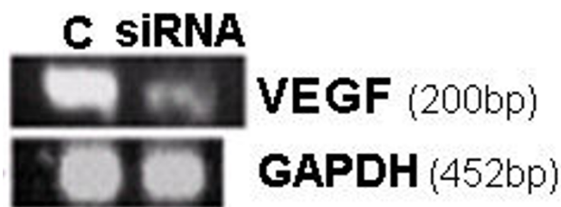
Figure 2 VEGF siRNA-generating pDNA down regulates VEGF mRNA levels in rat cervix. The VEGF gene silencing efficiency of the selected siRNA-generating pDNA was tested in vivo in the cervix of pregnant rat from GD17–20. VEGF siRNA-generating pDNA was found to down-regulate VEGF compared to control. n = 5, ( p < 0.05 ).

Out of a total of 30,000 genes, about 4,200 genes had altered gene expression at GD20, after intra vaginal administration of the VEGF inhibitor. Of these, gene expression of about 1,700 genes were up regulated ( p < 0.05 ), while the rest, slightly over 2400, were down-regulated ( p < 0.05 ). These genes are annotated in the database of NCBI's Reference Sequence project and are also found on the annotation list of Code link. Although there was a match between genes altered by VEGF siRNA and blocker, the impact of VEGF siRNA, with an efficiency of about 50%, on gene expression was significantly less pronounced compared to receptor antagonist. Only expression of about 300 genes were altered by VEGF siRNA, of which about 50 were up regulated and about 220 were down-regulated. Thus, henceforth, we will only focus on data from VEGF receptor antagonist-treated animals.