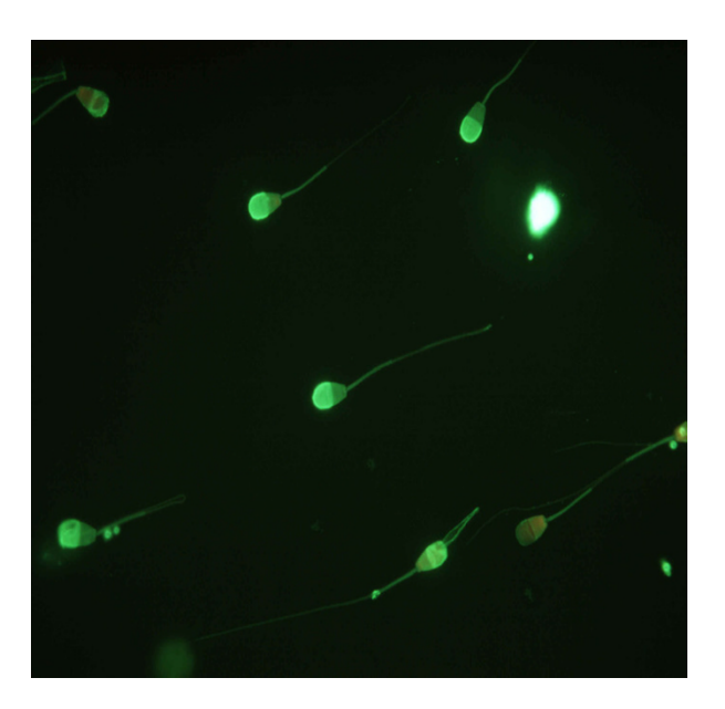
Figure 3 Live with intact acrosoma and dead spermatozoa without acrosoma after EthD/FITC-PSA test (1000×).