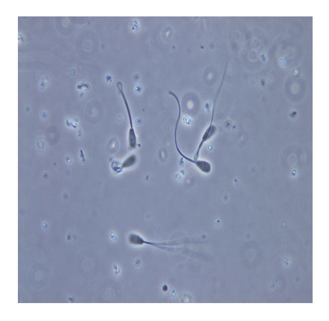
Figure I Inactive sperms and different swelling patterns of the active sperms after HOS test (1000×).